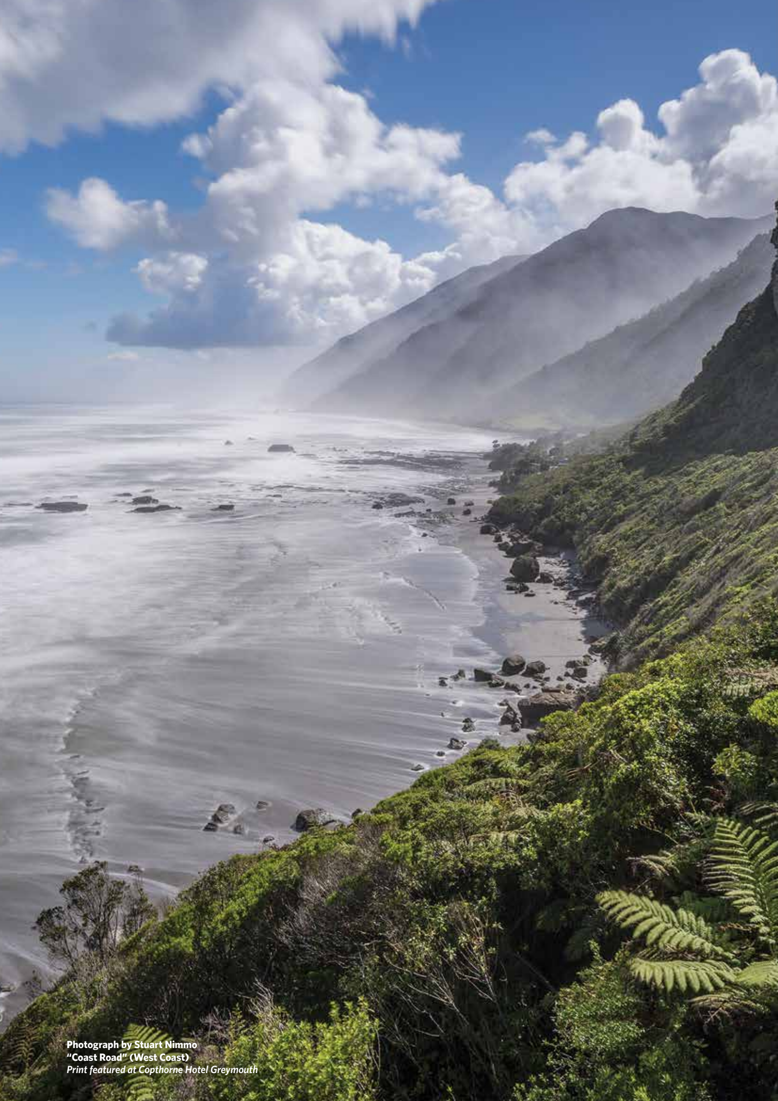
"Coast Road" (West Coast) Print featured at Copthorne Hotel Greymouth