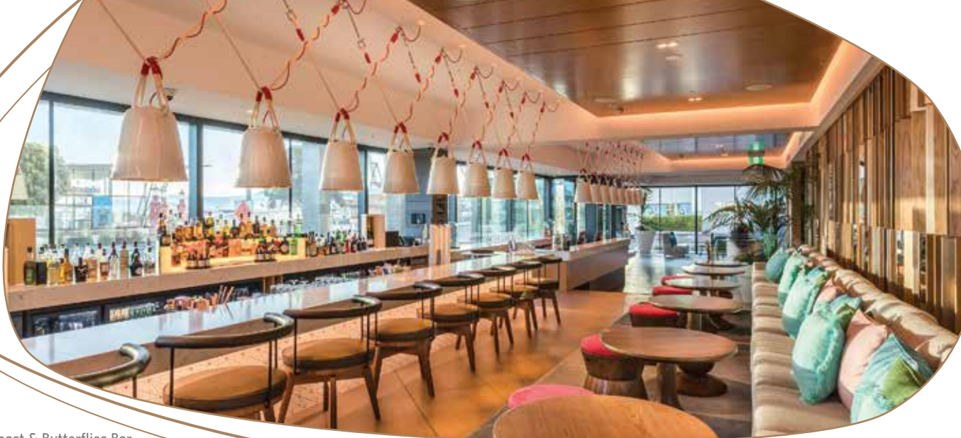
Beast & Butterflies Bar, M Social Auckland