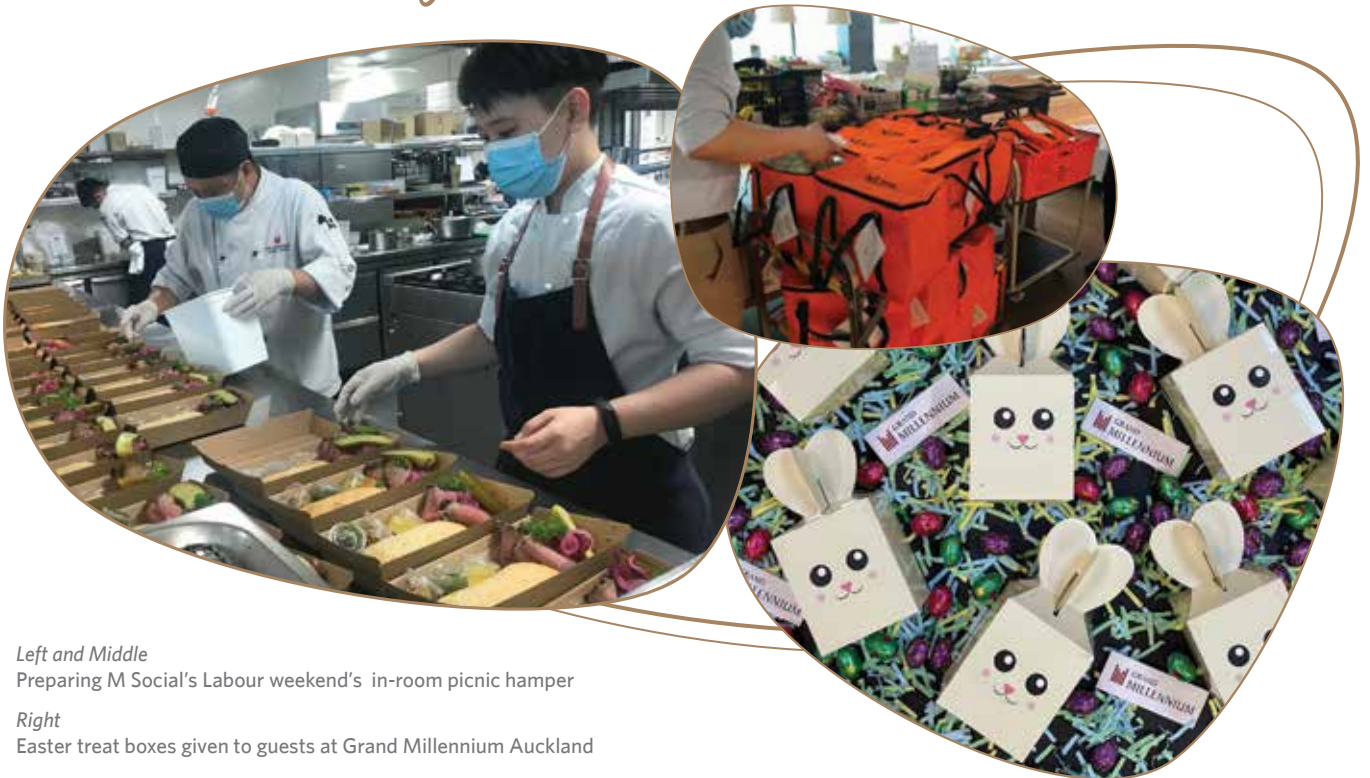
Left and Middle Preparing M Social's Labour weekend's in-room picnic hamper

Bringing kiwis home since the start of the Pandemic