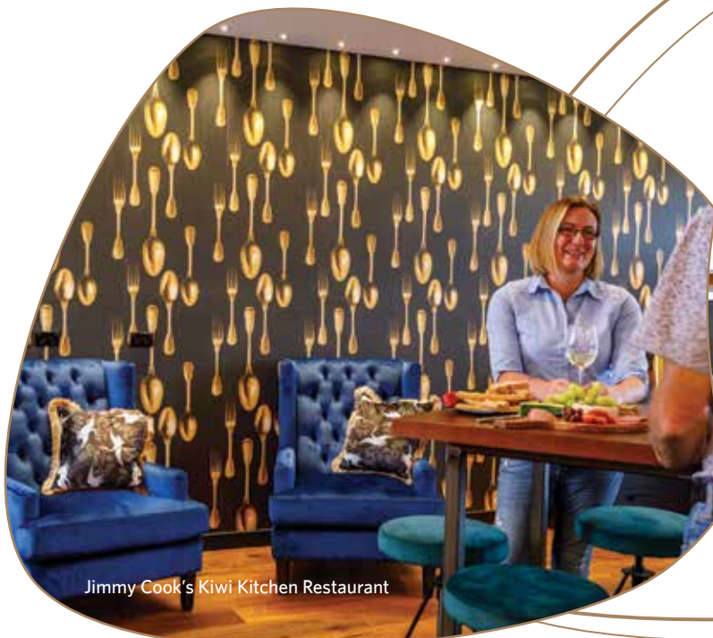
Jimmy Cook's Kiwi Kitchen Restaurant

The new look Jimmy Cook's has a unique feel, lush velvets, oversized lounging chairs and warm wood. With hues and textures inspired by the West Coast, pendants in pounamu green, tactile woven wallpaper, and accents of gold in a nod to the gold rush era, creating a sophisticated, understated elegance. You feel like you have finally been allowed into your flash Aunties 'front room' – the one with the fancy chairs, reserved for special occasions and guests. A little bit classy, but not too flash, you can relax and enjoy a gin and tonic served from the gin trolley, order a beer at the leaner or pull up a stool by the bar for a chat with Graham Collings, the General Manager, who has seen the refurbishment from start to finish. Even the new menu has the locals sitting up to take notice. The creative and clever use of local product, simple and flavoursome dishes that the local West Coast suppliers are so proud to be part of. From a satisfying three course, dinner to tasty light meals or snacks bursting with flavour, served for solo guests or groups, travellers or locals.