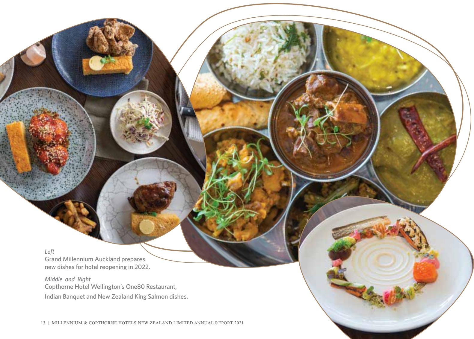
Left Grand Millennium Auckland prepares new dishes for hotel reopening in 2022.