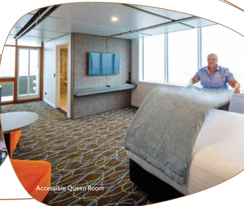
Accessible Queen Room