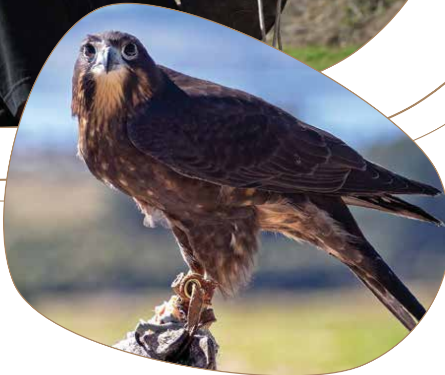
Right Millennium's adopted Karearea (New Zealand Falcon), Hiwi, named after a star in the Matariki cluster.